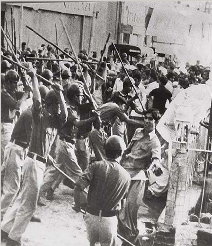
Police attacks a MRD rally in Karachi