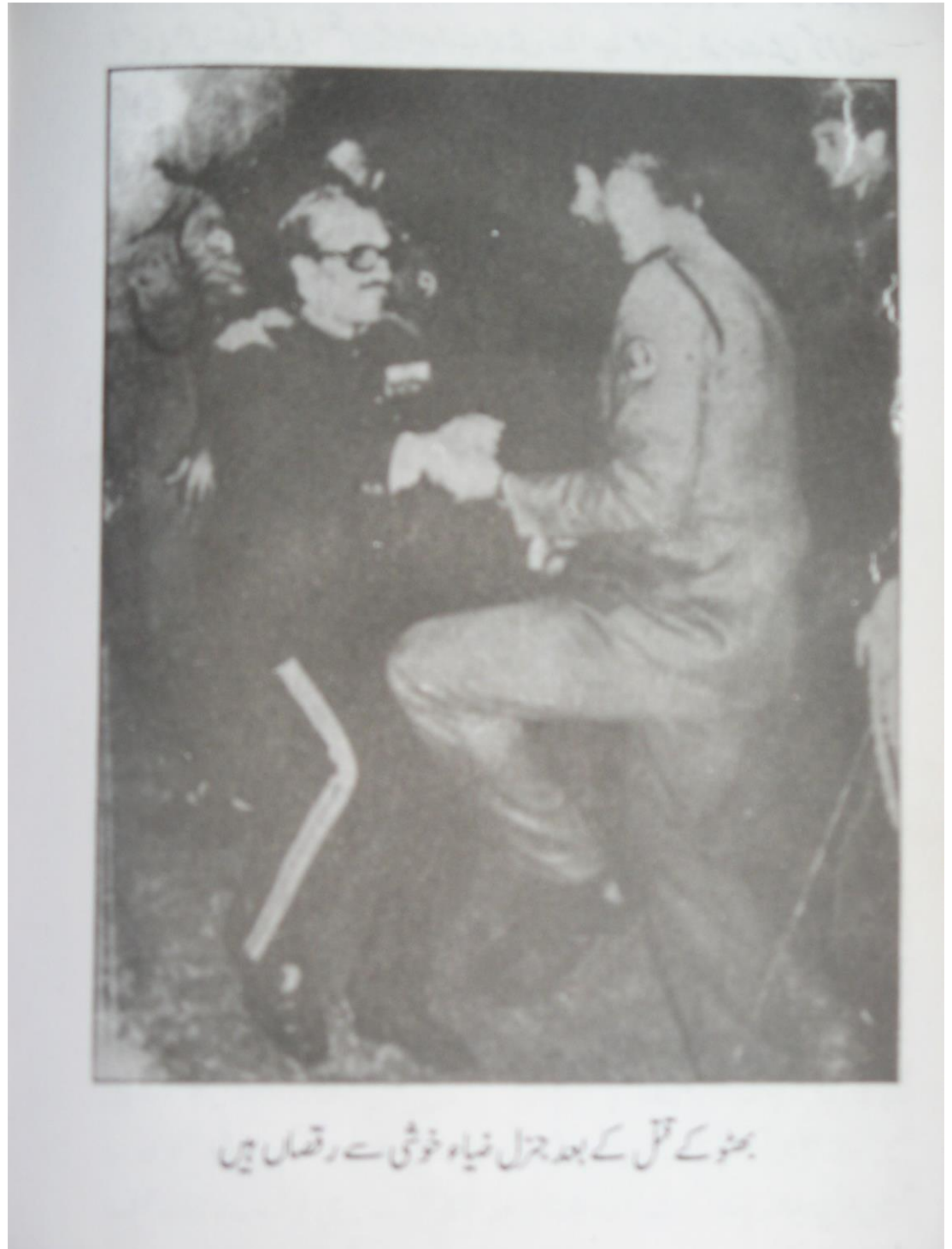
Figure 2 General Zia-ul-Haq, dancing in real after executing ZAB.

April, Maulana Mufti even said that PNA ministers should now resign as their objective had been achieved. 406