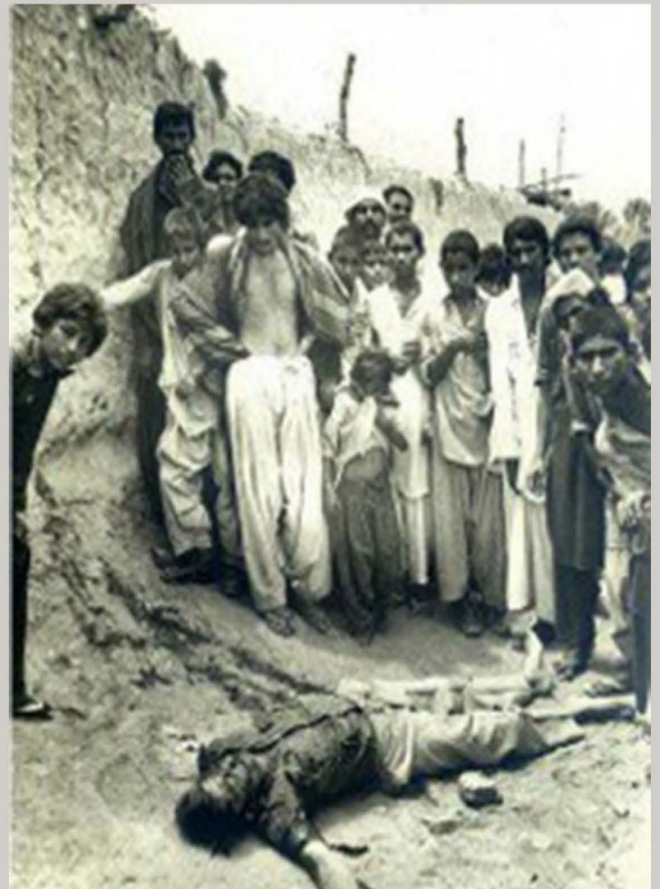
A dead protester in Moro