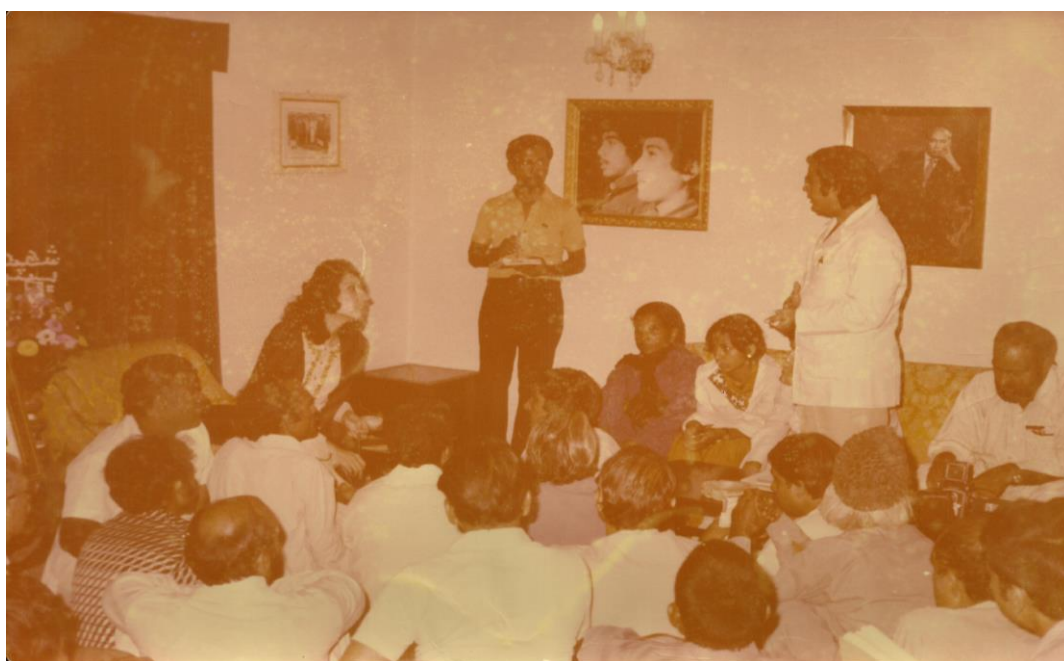
Figure 3 BB receiving and meeting with PPP's workers after the death of ZAB in June 1979.