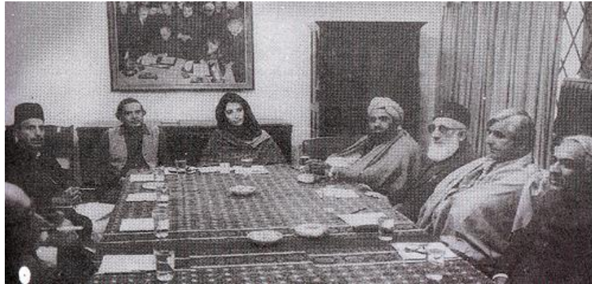
Figure 4 BB chairing the MRD in process meeting in 1980.

from both parties, 525 they finally agreed on one broad agenda 'Pakistan and martial law cannot exist.' 526 Finally on 6 February 1981, three major demands were put before the regime under the umbrella of the Movement for the Restoration of Democracy, which will be discussed in the next chapter.