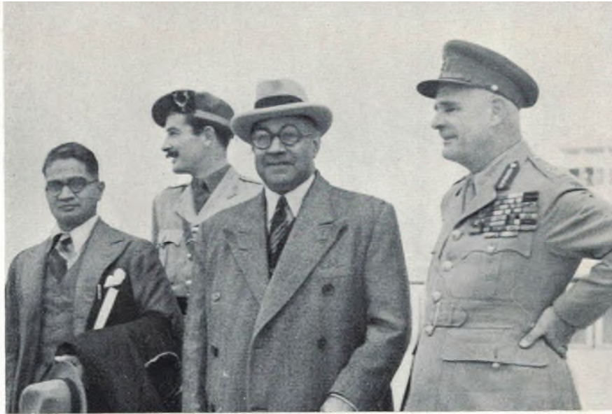
Departure for London : Lord Wavell and Liaqat Ali Khan at the Palam airfield