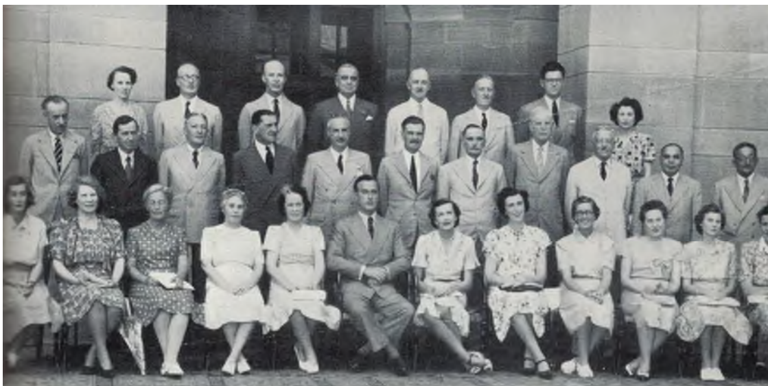
9(a). GOVERNORS' CONFERENCE IN DELHI, APRIL 1947.