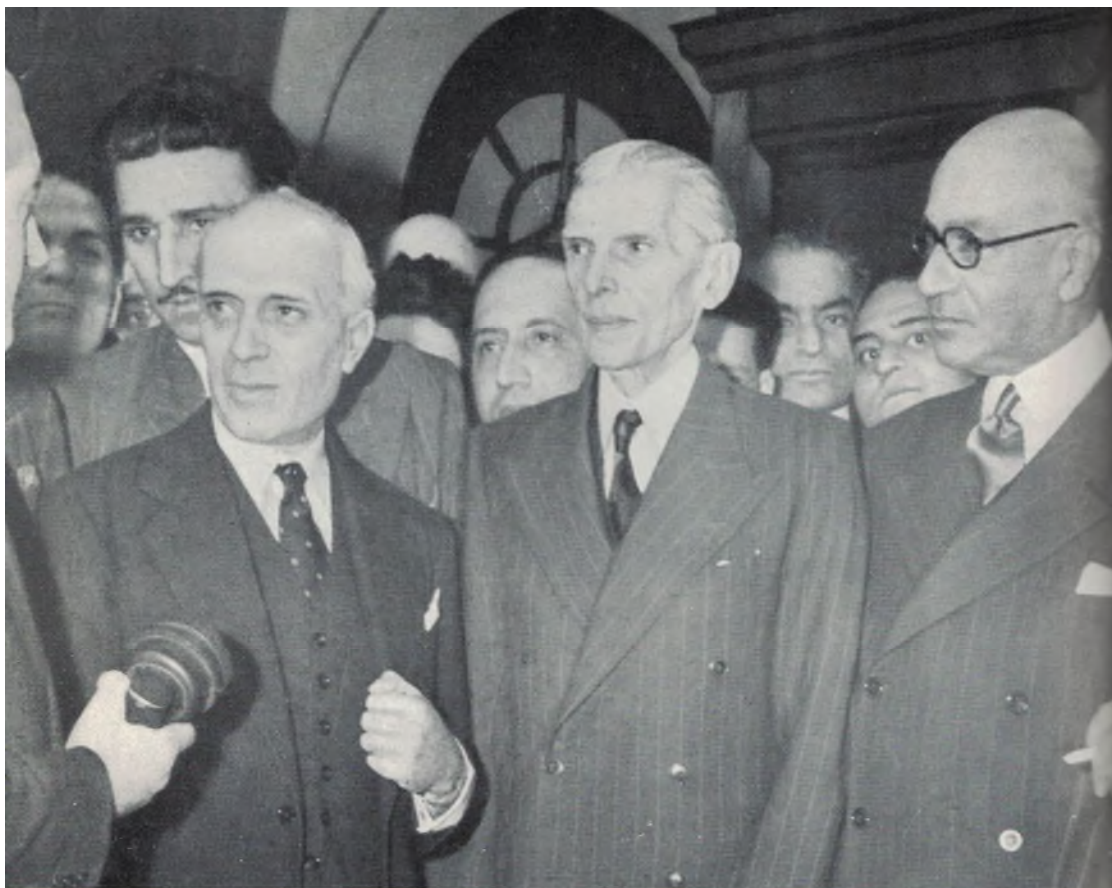
8. CONSULTATIONS IN LONDON Nehru and Jinnah with Sir Samuel Rungana- dhan, Indian High Commissioner in London