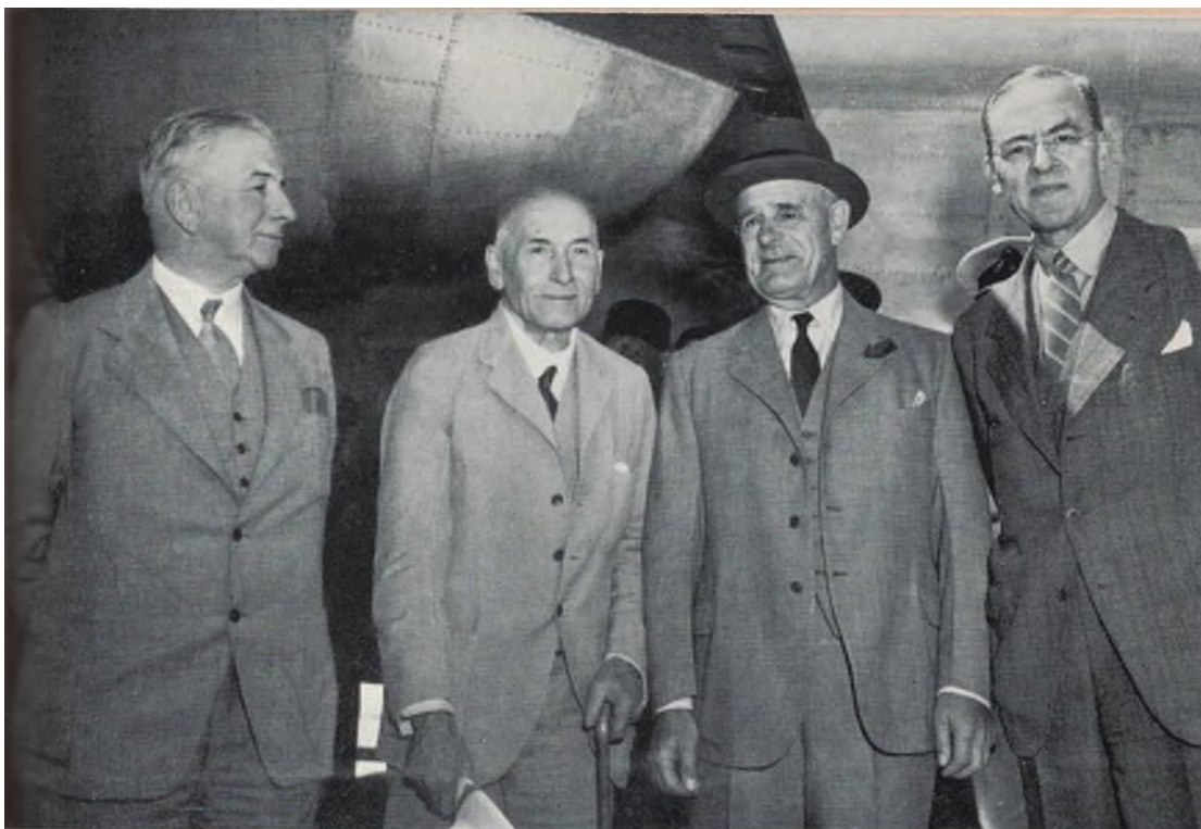
Lord Wavell receives Members of the Cabinet Mission at Palam Aerodrome in Delhi. (L to R) A.V. Alexander, Lord Pethick-Lawrence, Lord Wavell and Sir Stafford Cripps