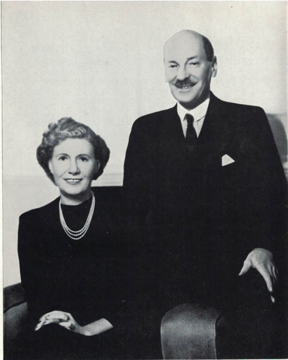
12. PRIME MINISTER ATTLEE AND MRS ATTLEE