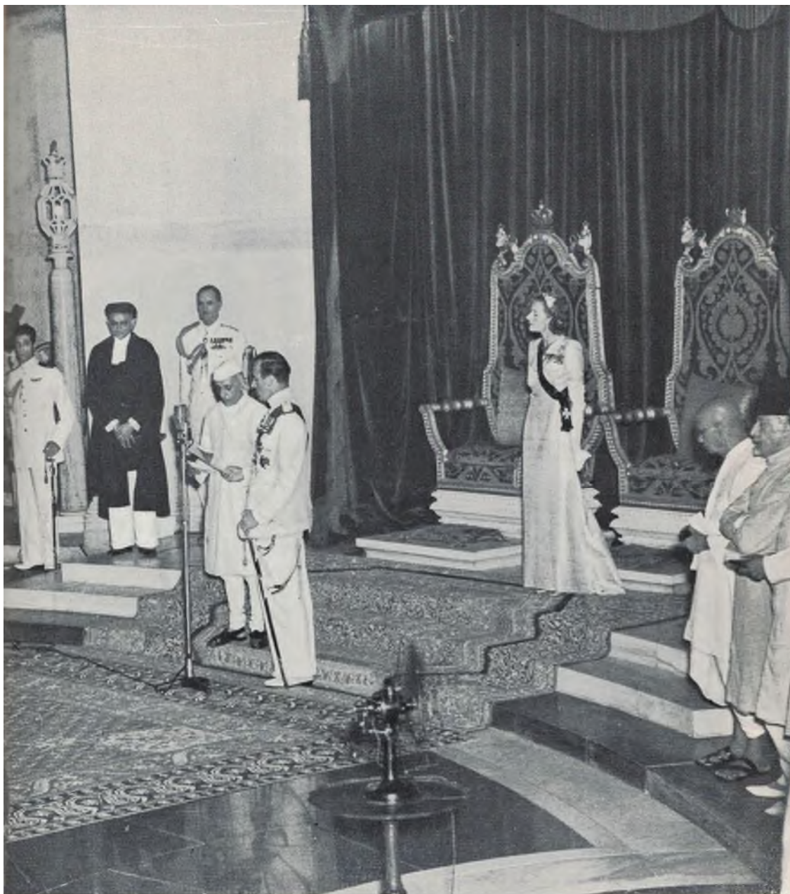
11. INDIA'S FIRST PRIME MINISTER Lord Mountbatten swearing in Nehru on 15 August 1947