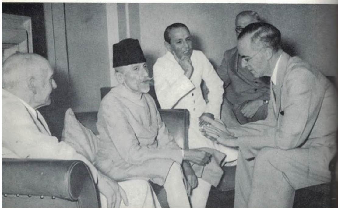
Cabinet Mission in discussion with Abul Kalam Azad. (L to R) Lord Pethick-Lawrence, Abul Kalam Azad, Asaf Ali, A. V. Alexander and Sir Stafford Cripps