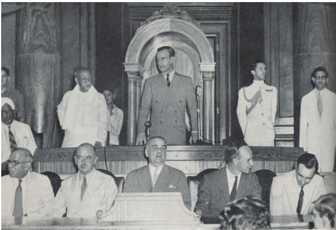
10 (a). PRESS CONFERENCE, 4 JUNE 1947