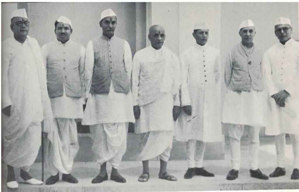
Members after being sworn in on 2 September 1946. (L to R) Sarat Chandra Bose, Jagjivan Ram, Rajendra Prasad, Vallabhbhai Patel, Asaf Ali, Nehru and Syed Ali Zaheer