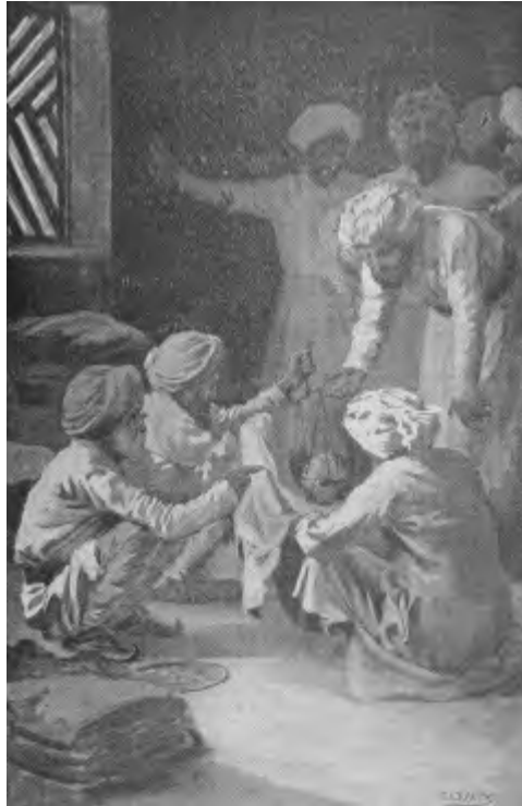
Dick and Surajah visit the fort disguised as merchants

tobacco, tobacco boxes, knives, and muslins for turbans; and as the news spread that these were to be obtained, the number of soldiers increased, until the room was quite crowded with them, as well as by many natives engaged in the work of rebuilding the fortifications.