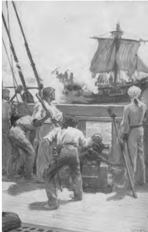
The Madras beats off two French privateers

"Aim at the foot of his mainmast," he went on. "Let each man fire as he gets the mast on his sight."