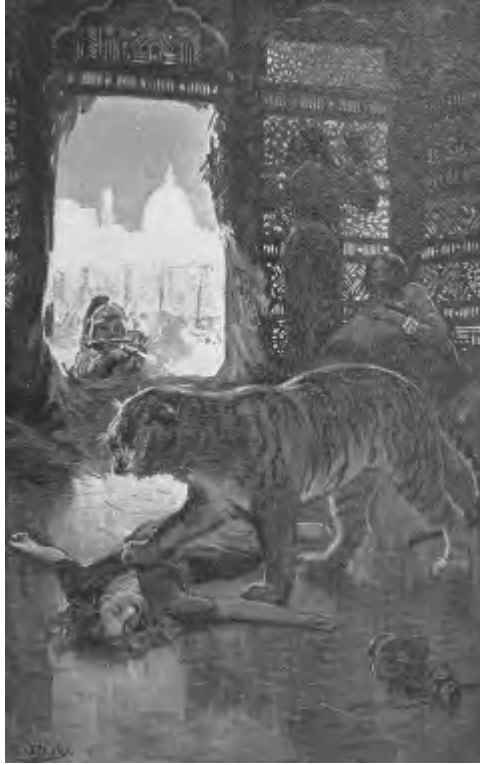
Dick took steady aim, and fired at the tiger

Dick stretched his right hand forward, took a steady aim, and fired. A sharp snarl showed that the shot had taken effect. He dropped the pistol, snatched the other from his mouth, waited for a moment until he could make out the tiger, fired again, and at once dropped to the ground, just as a great body flashed from the window above him.