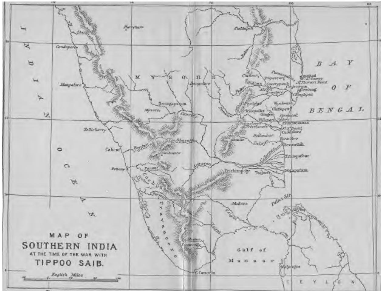
Map of Southern India at the time of the war with Tippoo Saib

Madras was governed by imbeciles. Its Council was composed entirely of timid and irresolute men. It was clear to all that, before any force capable of withstanding him could be put in the field, the whole country, beyond reach of the guns of the forts at Madras, would be at the mercy of Hyder.