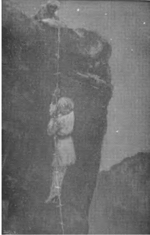
Dick and his friends escape from the hill fortress

Dick laid himself down as Surajah had done, and crawled backwards until he was lying half over the edge. Then he seized the rope and began to descend, hand over hand. He counted the rungs as he went down, and half way he sat down on one of the long pieces, hitched the hooks on to the one above, and rested his arms. After a short pause, he continued until he reached the bottom.