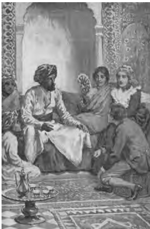
The Rajah tells the story of the war

"You must know," the Rajah began, "that the war was really the result of the intrigues of Sir Thomas Rumbold, the governor of Madras, and his council. In the first place, they had seriously angered the Nizam. The latter had taken a French force into his service, which the English had compelled Basult Jung to dismiss; and Madras sent an officer to his court, with instructions to remonstrate with him for so doing. At the same time, they gave him notice that they should no longer pay to him the tribute they had agreed upon, for the territory called the Northern Circars. This would have led to war, but the Bengal government promptly interfered, cancelled altogether the demands made by the Madras government, and for the time patched up the quarrel. The Nizam professed to be satisfied, but he saw that trouble might arise when the English were more prepared to enforce their demands. He therefore entered into negotiations with Hyder Ali and the Mahrattis for an alliance, whose object was the entire expulsion of the British from India.