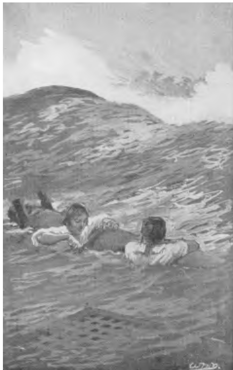
The Captain and Ben lash themselves to the spar.

"There is no saying, lad, no saying at all. All I know is that your father, the captain, was washed ashore at the same time as I was. As you have heard me say, I owed my life to him. I was pretty nigh gone when I caught sight of him, holding on to a spar. Spent as I was, I managed to give a shout loud enough to catch his ear. He looked round. I waved my hand and shouted, 'Goodbye, Captain!' Then I sank lower and lower, and felt that it was all over, when, half in a dream, I heard your father's voice shout, 'Hold on, Ben!' I gave one more struggle, and then I felt him catch me by the arm. I don't remember what happened, until I found myself lashed to the spar beside him.