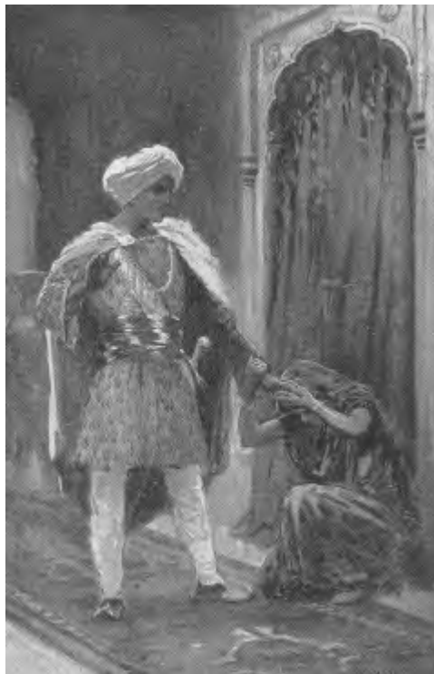
The white slave girl thanks Dick for saving her life

"What is it, child?" he said. "You must have mistaken me for someone else."